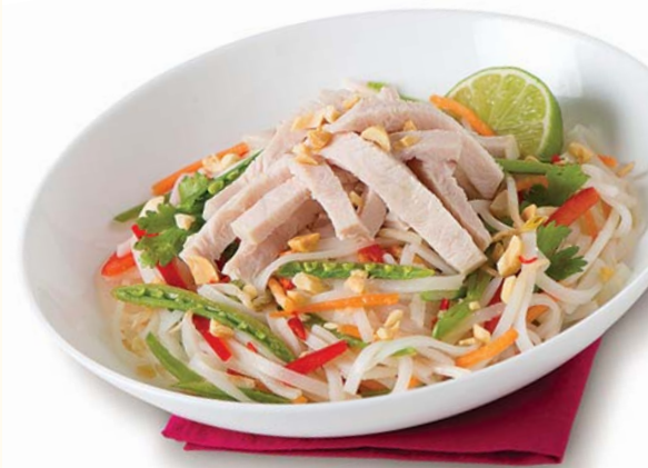
TURKEY AND SNAP PEA ASIAN NOODLE BOWL

Whisk the lime juice with the vinegar, fish sauce, soy sauce, sugar, garlic, ginger and chilies. Set aside. Place the noodles in a large bowl and cover with boiling water. Let stand for 5 minutes or until tender. Drain well and place under cold water until it runs clear. Toss the noodles with the dressing, red peppers, snap peas, bean sprouts, carrots, green onion and cilantro. Top each serving with 4 oz (125 g) sliced Cuddy Servemaster ® turkey. Sprinkle with peanuts (if using) and serve with a lime wedge. Salad yield (without turkey) = 24 cups (1.7 kg) Tip: Serve in Chinese takeout containers with chopsticks.