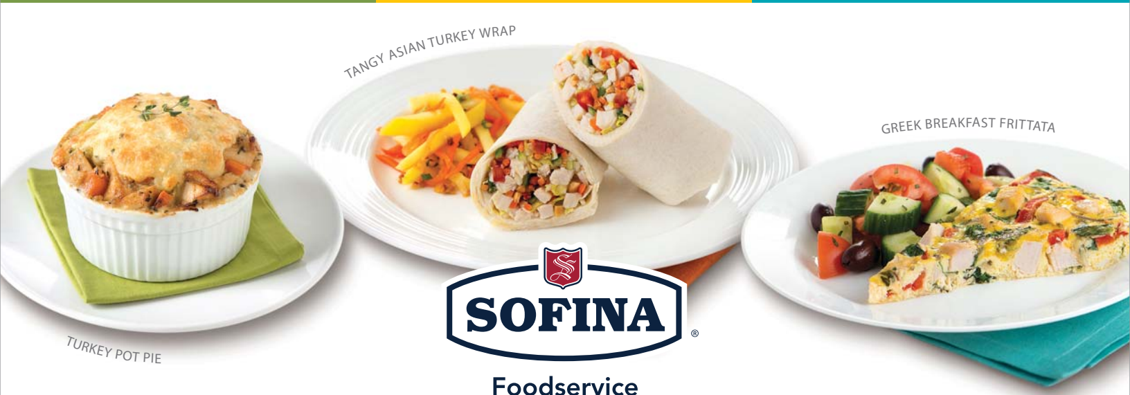
TURKEY POT PIE