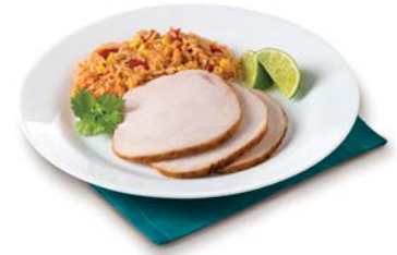
TURKEY WITH FIESTA RICE