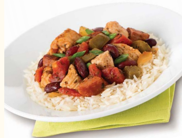
CREOLE RICE WITH TURKEY, SHRIMP & SAUSAGE

CONTACT YOUR SOFINA ACCOUNT MANAGER FOR MORE DELICIOUS CUDDY SERVEMASTER RECIPES.