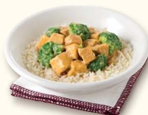
CHEESY TURKEY AND BROCCOLI